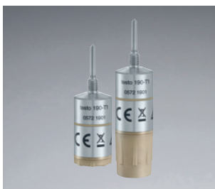
Small or large battery