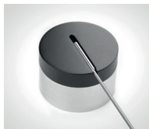
Freeze-drying probe holder