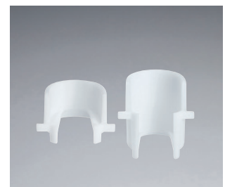
Distance adapter short or long