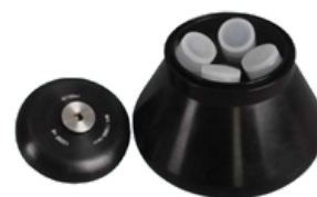
No.14 Fixed rotor

Capacity:4x100ml Max speed:10000 rpm Max RCF:10975xg