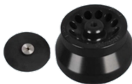
9.Swing out rotor

Capacity: 12x10 ml Max speed: 11000 rpm Max RCF: 10710 xg