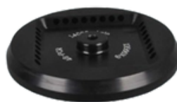
13.Swing out rotor

Capacity: 32x0.2 ml PCR Max speed: 14000 rpm Max RCF: 13500 xg