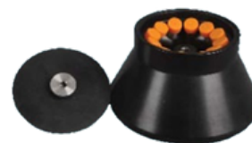
10.Swing out rotor

Capacity: 10x15ml ( Conical ) Max speed: 11000rpm Max RCF: 13960 xg