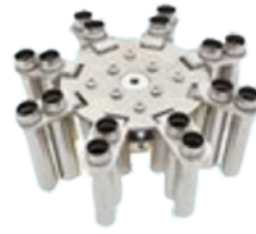
12.Swing out rotor

Capacity: 16x10 ml Max speed: 4000 rpm Max RCF: 2690 xg