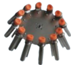
9.Swing out rotor

Capacity: 12x10 ml Max speed: 4000 rpm Max RCF: 2600 xg