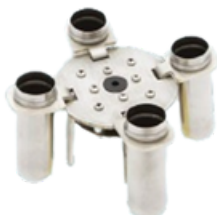
11.Swing out rotor

Capacity: 4x50 ml Max speed: 4000rpm Max RCF: 2420 xg