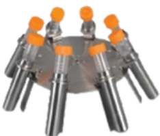
10.Swing out rotor

Capacity: 8x15ml Max speed: 5000rpm Max RCF: 2690 xg