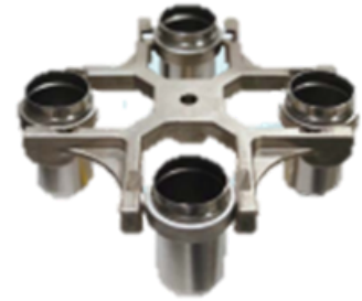
No.3 Swing rotor

Capacity: 4x50 ml Max speed: 4000 rpm Max RCF: 2780 xg