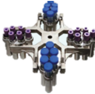
No.2 Swing rotor

Capacity: 24x10/15 ml Max speed: 4000 rpm Max RCF: 2780 xg