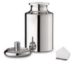
□ Sheet weight ▣ Knob weight with adjusting cavity