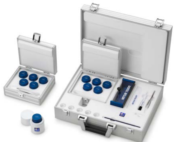
Weight Set, Weight Set with accessories and Individual Weights