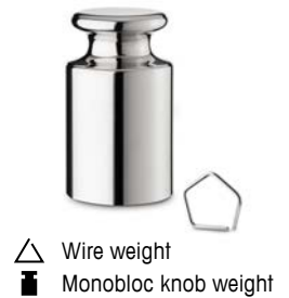
△ Wire weight ■ Monobloc knob weight