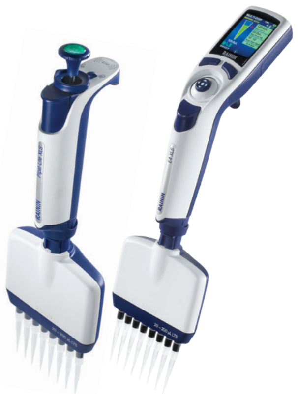
Pipet-Lite XLS+ and E4 XLS+ models

Speed plate work with the Rainin E4 XLS+ electronic multichannel pipettes. Specialized modes streamline how you transfer multiple aliquots, perform serial dilutions and program complex pipetting routines.